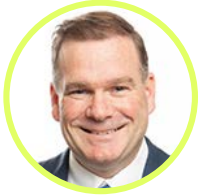
HON. TODD MCCARTHY

Minister Ministry of Public & Business Service Delivery