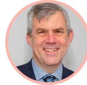
CHRIS FORBES Deputy Minister Department of Finance