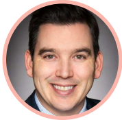
MINISTER TERRY BEECH Ministry of Citizens' Services