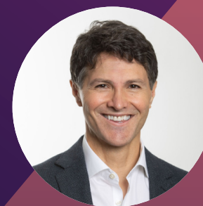
Victor Dominello Director, UNSW-UTS Trustworthy Digital Society Hub, Board Member, Tech Council Australia