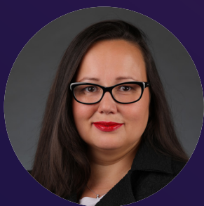
The Hon. Harriet Shing Minister for Regional Development, Minister for Water, and Minister for Equality