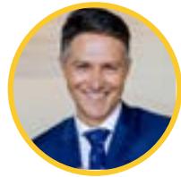
THE HON. VICTOR DOMINELLO

Minister of Jobs, Economic Development and Innovation Government of British Columbia