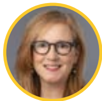
THE HONOURABLE BRENDA BAILEY

Deputy Minister to the Premier, Cabinet Secretary, and the Head of the Public Service, Office of the Premier Government of British Columbia