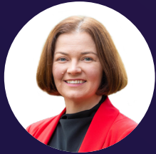
Lisa Chesters MP Federal Member for Bendigo

Hear from digital and innovation leaders across government, industry, and academia.