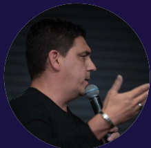
Corey Gray Global CEO, Smart Cities Council