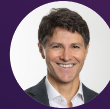
Victor Dominello Director, UNSW-UTS Trustworthy Digital Society Hub, Board Member, Tech Council Australia