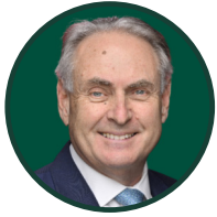
Senator the Hon. Don Farrell Minister for Trade and Tourism and Special Minister of State