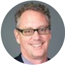
IAN RONGVE ADM Ministry of Health