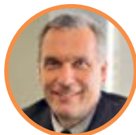
LAURIER DONAIS Deputy Minister Ministry of Government Relations