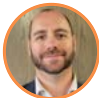
RORY JENSEN Assistant Deputy Minister Ministry of Education, Government of Saskatchewan