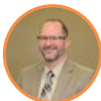
CLINT REPSKI Deputy Minister Ministry of Education