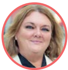
LINDA COWAN CIO British Columbia Security Commission